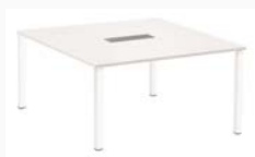
Table white 2 pieces 143x143 cm