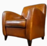
Vintage chair cognac 2 pieces