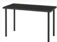
Table black 1 piece 150x75 cm