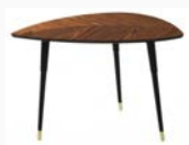
Vintage coffee table 1 piece