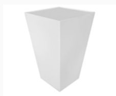
Lectern 2 pieces Grey 60x60x114 cm