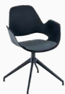
Plastic chair black 5 pieces