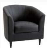
Chair black 6 pieces