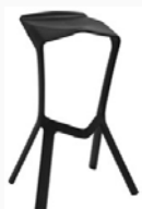
Bar stool black 6 pieces